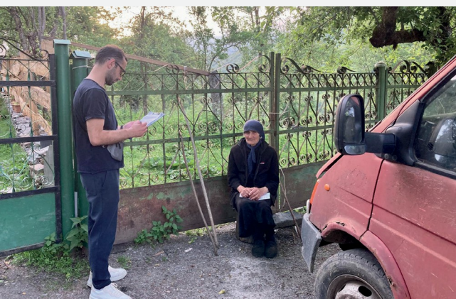
Sample structured interview conducted by local interviewers

Agora CE's role in the project is to mediate communication with the local population, who were essentially faced with a fait accompli before the creation of the protected area. At the beginning of the project, our activities focused on