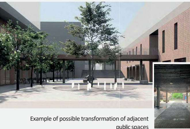
Example of possible transformation of adjacent public spaces

The building of the shopping centre in Těšíkova Street in Kamýk, Prague 12, does not deny the time when it was built. It was built during the 1980s and does not meet the current requirements for civic amenities. The aim of the project was to engage the public in a discussion on the question of what functions the shopping centre (owned by the City of Prague) should fulfil in the future. The result was a recommendation for the concept of the building's use and a brief for an architectural competition, on which we collaborated with architect Tereza Scheibová of coll coll. The project included a series of activities, individual interviews with key representatives of the residents of the estate, public meetings, guided walks. The project itself revealed much deeper themes of the revitalization of prefabricated housing estates and their civic redevelopment.